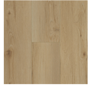
Sandbar Glow SKU: 676PA605