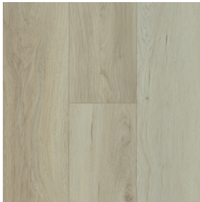
Bayside Breeze SKU: 676PA601