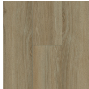
Forest Folic SKU: 676PR603