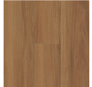
Coastal Copper SKU: 676PA607