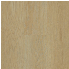
Sandy Soiree SKU: 676PR602