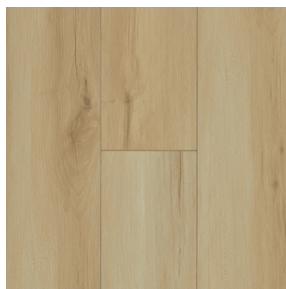
Coral Charm SKU: 676PA604