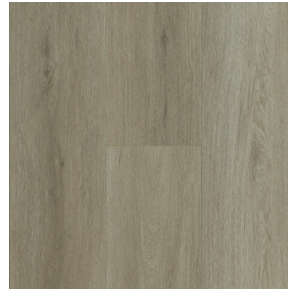
Willow Whisper SKU: 676PA602