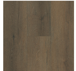
Captain's Cove SKU: 676PB606