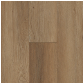
Meadow Mingle SKU: 676PA608