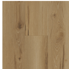
Driftwood Daze SKU: 676PA606